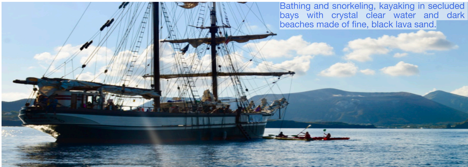
Bathing and snorkeling, kayaking in secluded bays with crystal clear water and dark beaches made of fine, black lava sand.