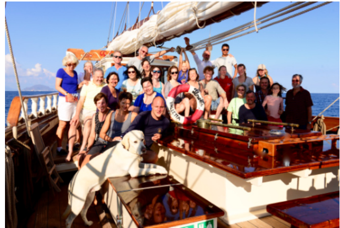
Active volcanoes, sailing fun, nature, culture and adventure are waiting for you!

There will be many factors that influence our day to day schedule. The wind that freshens up for a nice sail, the fish that is caught for the perfect evening BBQ, or we just fall in love with a quiet bay. We have allowed plenty of time to enjoy and appreciate the islands.